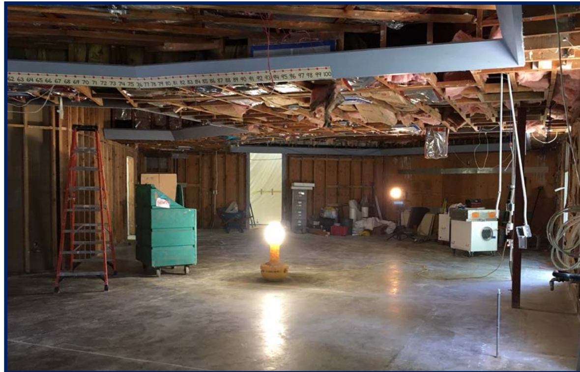
Ruskin - FIS