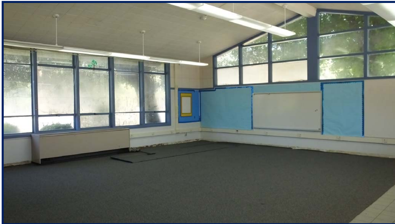
Toyon – Kindergarten Classroom