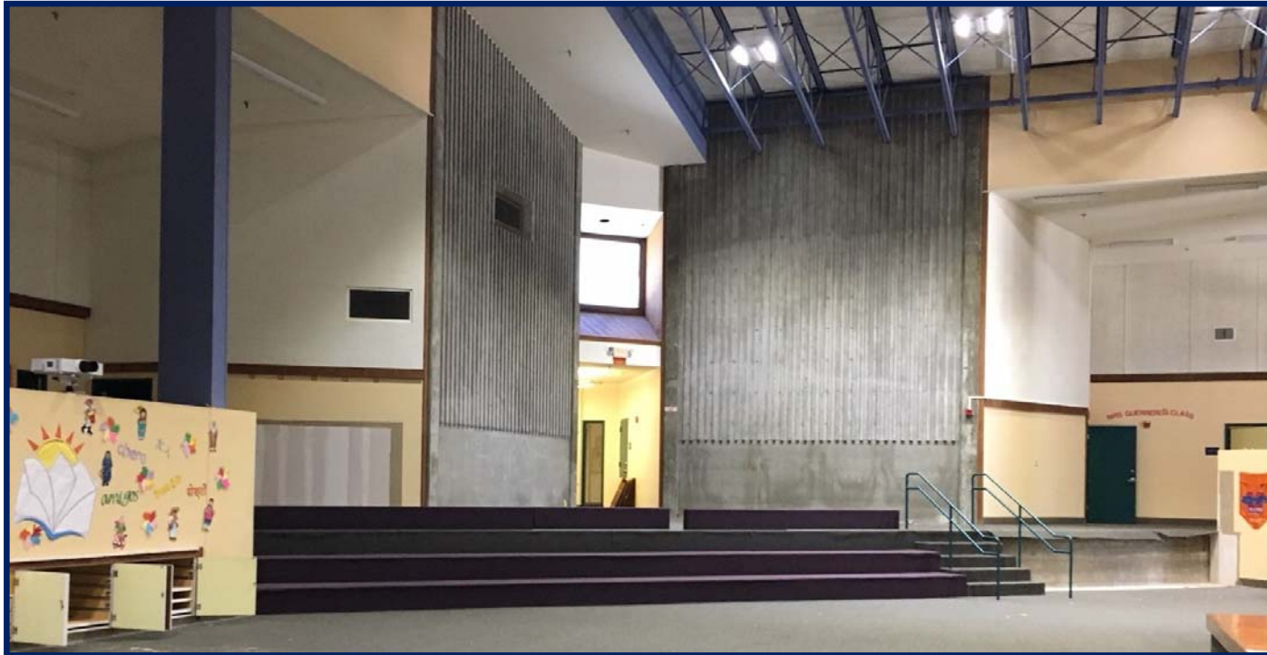
Cherrywood - MPR